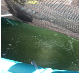
Figure 3. Floc formation

Concentrations of temperature, DO, and pH in each treatment ranged from 26-28°C; 5.2-8.57 mg / L; and 6-7. The three parameters show the results in the maintenance media are within reasonable limits for the growth of tilapia. Temperature requirements according to [8] 25-32°C as well as (DO) dissolved oxygen is within the proper limits for the growth of tilapia, according to the requirements of [8] SNI, DO is a minimum of 3 mg / L tilapia can still grow well at dissolved oxygen 5.2-8.57 mg / L. The pH concentration of water in the pond is within a reasonable limit for the growth of tilapia, ranging from 6-7 while [8] requirements are 6.5- 8.5.