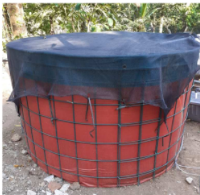
Figure 1. Biofloc Ponds

This research is a research development (R & D). The development procedure uses the Borg and Gall model. Biofloc technology application is also carried out in this activity, namely making biofloc pools, preparing water media, growing floc, feeding management and water quality management.