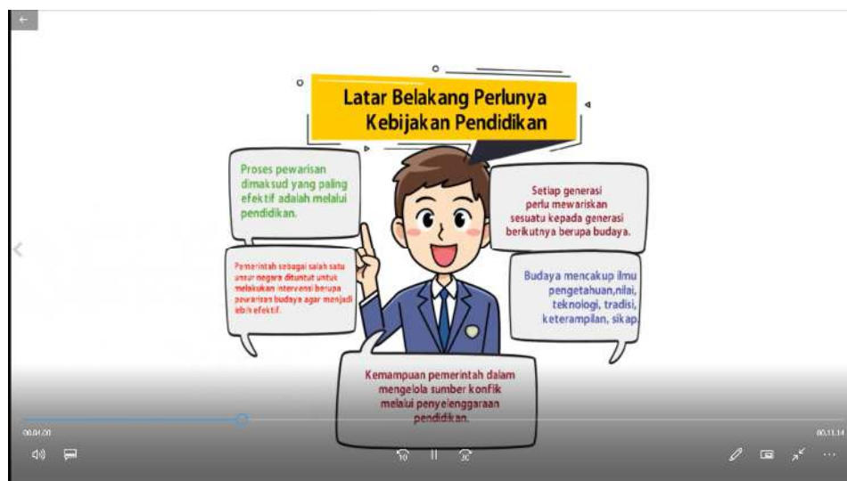
Figure 2 material of whiteboard animation