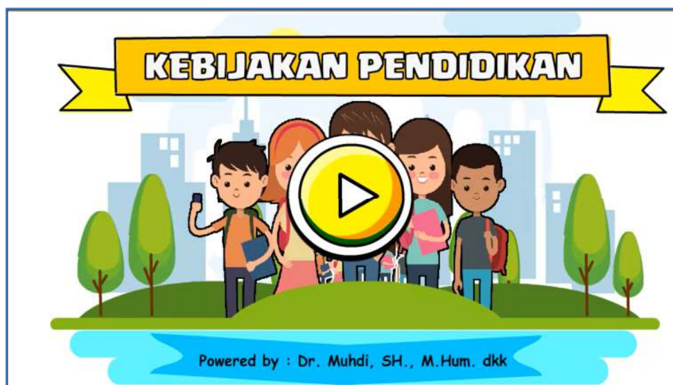
Figure 1 whiteboard animation media

The product that will be generated in this research is whiteboard animation in public policy topic for the first grade on post graduates students. The following image is the product design that has been made.