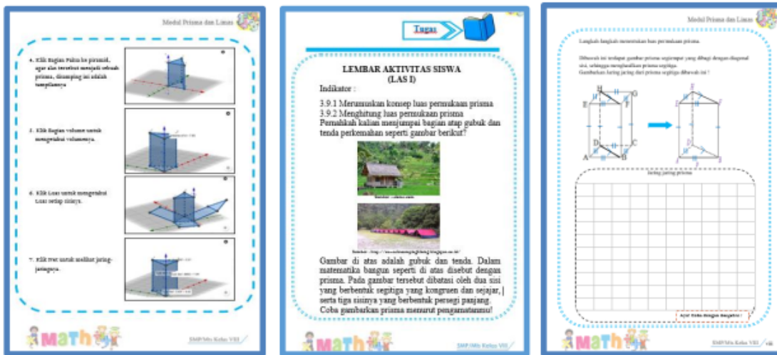
Fig. 1. Product Overview

gebra module to enhance the students' visual representation capabilities. In the first stage of the development process, an analysis of the needs of the students, the curriculum, and learning materials is performed. The study of the needs of students showed that students require learning materials in the form of a side room of the wake geometry module. The second stage is design, instrument module redesign assessment, and evaluation. Design that is done the lines of products. The design of the module assessment instrument is based on the study of the literature. The results in the assessment and question form the lattice test question. From this stage, the product design developed is module geometry woke up flat-sided space-assisted Geogebra. The third stage is development. The product geometry module is displayed in flat-side room wake-assisted Geogebra (Figure 1).