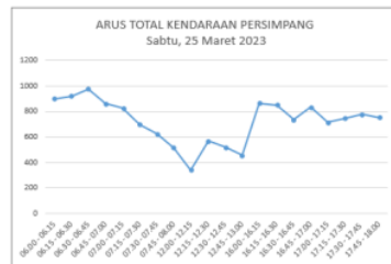
Gambar 4.1 Grafik arus total kendaraan per simpang hari Sabtu, 25 Februari 2023

Table 4.1 shows the total flow of vehicles on Saturday, 25 February 2023. The following is a graph of the total flow of vehicles per intersection on Saturday, 25 February 2023