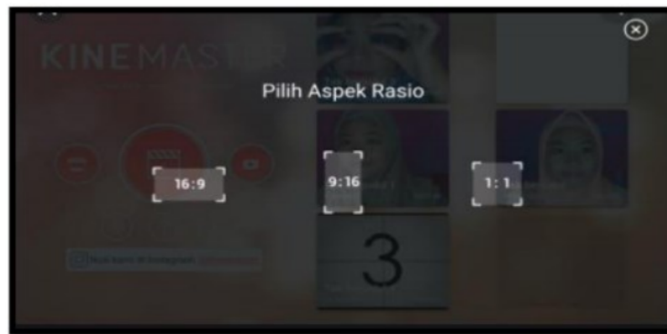
Figure 2. Use of Kinemaster software

This research is carried out in two stages, namely the development stage of interactive learning media and the implementation stage of interactive learning media. Needs analysis conducted through interviews showed that teachers of Al Azhar 14 Semarang Kindergarten concluded that interactive multimedia learning for listening activities (literacy) for early childhood is needed. Learning development design planning begins with determining competency standards, basic competencies, learning achievement indicators, and learning strategies to be carried out. The competency standard presented is Increasing Children's Knowledge of the Theme of Yourself. The learning materials presented include Getting to Know the Limbs. The material is in the form of Audio video Media (Interactive). The video is edited using Kinemaster software. To bring up animations of writing, sound, and music, use Ms. PowerPoints Software 2019. Display design on Animated Videos and clickable buttons to be Interactive, using the Hyperlink menu in Ms. PowerPoints 2019. The learning applied is communicative interactive learning between teachers and students using computer-assisted learning media, laptops, and Liquid Crystal Display (LCD) viewer projectors for the delivery of teaching materials. Figure 2 i design of learning media at the stage of making videos.