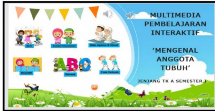
Figure 4. Merger Results (HOME)

is about how to make dolls out of origami paper. The language aspect contains about children's songs part of the limbs, after the child listens through the song the child can repeat the song heard and can mention parts of his limbs, the physical motor aspect contains about children moving their limbs to be healthier and stronger.