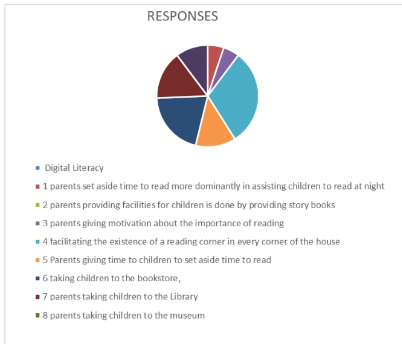
Figure 1. Diagram of Strengthening Digital Literacy in Family Education