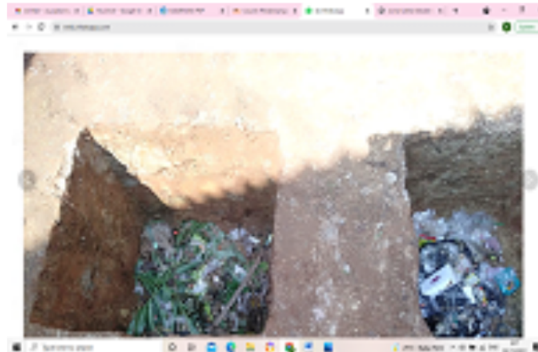
Figure 2: "Luwangan" organik dan anorganik.

bacteria. Modern society refers to it as inorganic waste [35]. Inorganic waste will be burned once a week. Here is a picture of the two "luwangan":