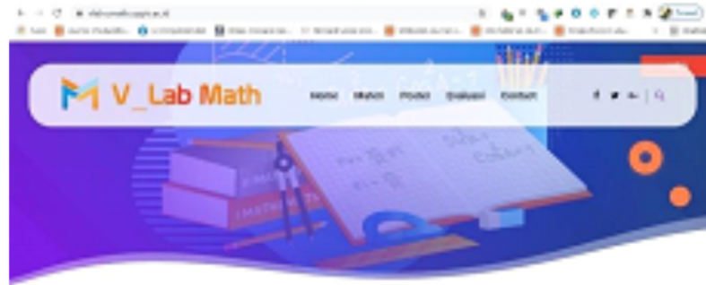
Figure 2: View from Virtual Laboratory.

The next stage after the initial development of a virtual mathematical learning laboratory is expert validation. Validation is carried out on virtual products of mathematical learning laboratories, learning modules as well as other learning devices. First the description of validity data based on expert assessment of materials and learning of learning modules to support the use of virtual mathematics laboratories. Material and learning experts consist of 3 people giving an assessment of the validity of mathematics learning modules. The results of this validity assessment are used as a prerequisite in filling in the content of material in a virtual mathematics laboratory. Expert assessment data of materials and learning is presented in Table 1.