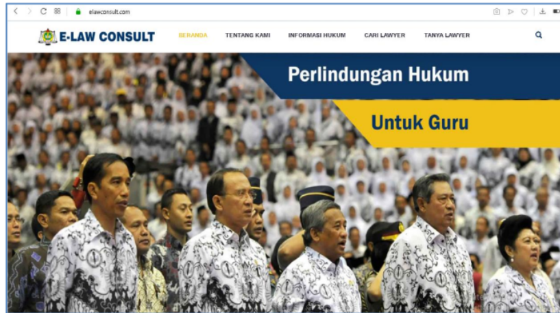
Figure 2. revision e-law consult product

and menu such as adding the photo of the lawyer to be contacted, making it easier for teachers to communicate, then the existing data base must be protected by various hackers, so that the confidentiality of the problems of the teachers is able to be kept and their confidentiality maintained