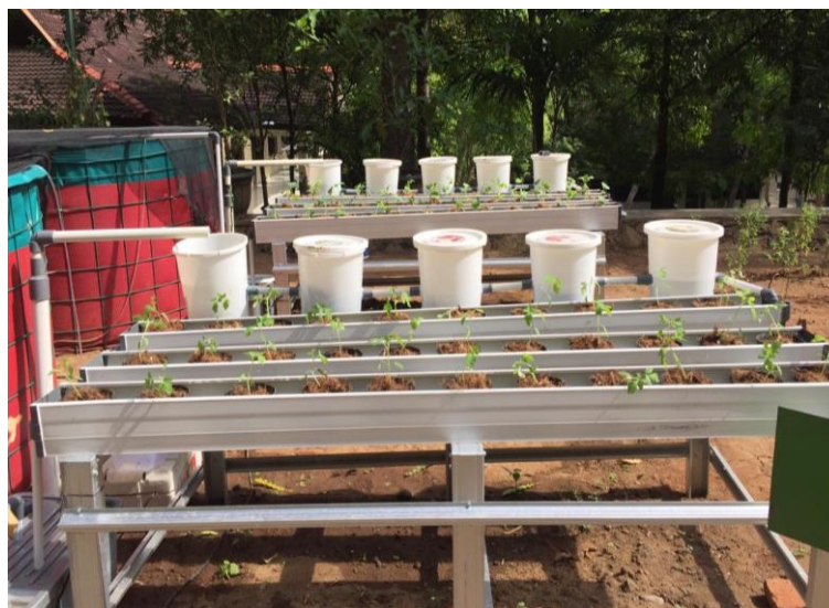
Fig 6:- Series of development of environmentally friendly biofloc and aquaponic systems with eggplant plants

In this series of potted plants as planting media were given gravel and coconut fiber. Gravel is a growing medium that functions almost the same as sand. Most farmers who use this gravel growing media to get space for roots to grow optimally. Not only that, gravel can also help the circulation of nutrient solutions and the air. Coconut coir dust as a planting medium is claimed to have a high water capacity. Coconut coir powder is known to be able to store water up to 73% or 6-9 times the volume.