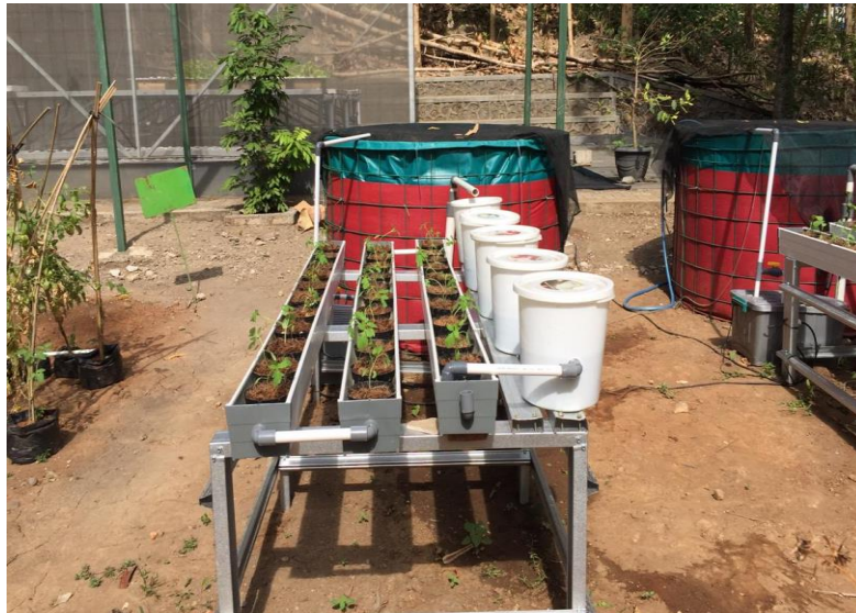
Fig 5:- Series of development of environmentally friendly biofloc and aquaponic systems with tomato plants