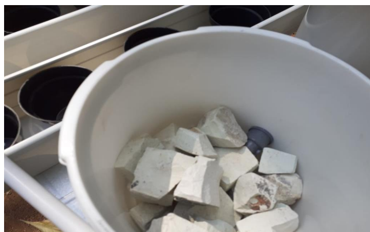
Fig 3:- Filter basket containing zeolite stones

At the beginning before the fish were stocked, probiotics were given, namely EM4 (Effective Microorganisms 4) floc forming at a dose of 5 cc / m 3 . The addition of probiotic bacteria is carried out along with the accumulation of feed given in the maintenance media for 42 maintenance days. Ammonia, nitrate, nitrite, dissolved oxygen (DO), temperature, pH and fish length measurements were taken during maintenance. Fish length measurement at the beginning and end of maintenance for 42 days was carried out randomly by taking a sample of 100 fish from a total population of 300 in the biofloc pond.