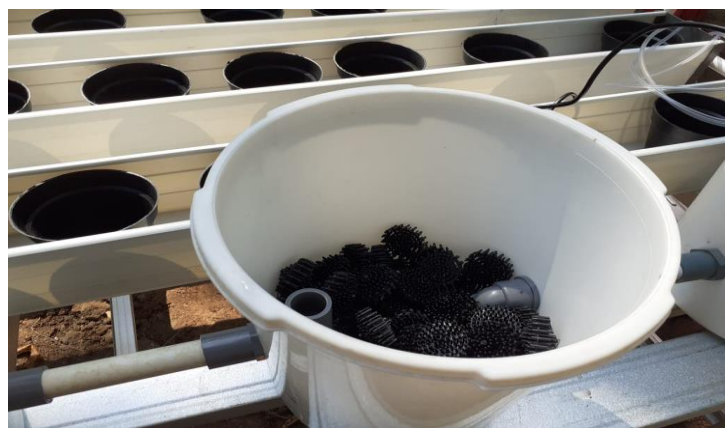
Fig 2:- Filter basket containing jagged rubber balls

In this activity the application of a combination of biofloc and aquaponic technology is carried out by adding a filter basket. Perforated plastic balls (Figure 2) and zeolite stones (Figure 3) placed in baskets serve to neutralize and increase oxygen levels ( O_2 ), neutralize water pH and stimulate plankton culture more quickly, replace and absorb toxic chemical compounds that present in water such as N_2 , NH_3 and CO_2 , as controlling the degree of pollutants and ammonia that comes from manure and leftover food that is not well absorbed, maintaining water quality and stability.