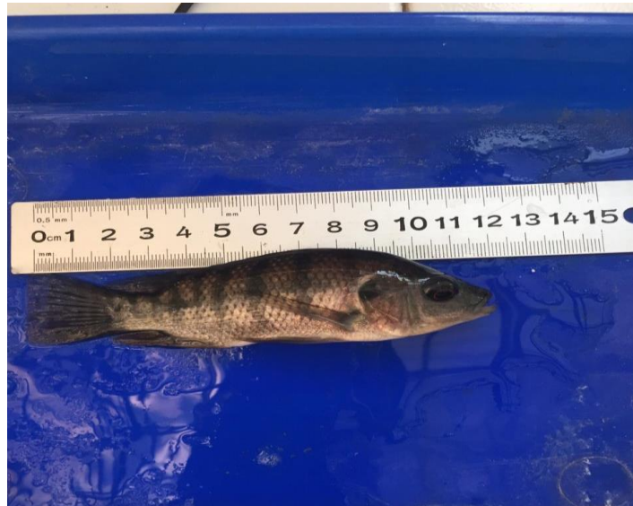
Fig 7:- Measurement of initial maintenance of Tilapia ( Oreochromis niloticus )