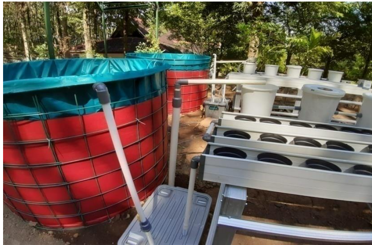
Fig 1:- Series of development of environmentally friendly biofloc and aquaponic systems

In this activity the application of a combination of biofloc and aquaponic technology is carried out by adding a filter basket. Perforated plastic balls (Figure 2) and zeolite stones (Figure 3) placed in baskets serve to neutralize and increase oxygen levels ( O_2 ), neutralize water pH and stimulate plankton culture more quickly, replace and absorb toxic chemical compounds that present in water such as N_2 , NH_3 and CO_2 , as controlling the degree of pollutants and ammonia that comes from manure and leftover food that is not well absorbed, maintaining water quality and stability.