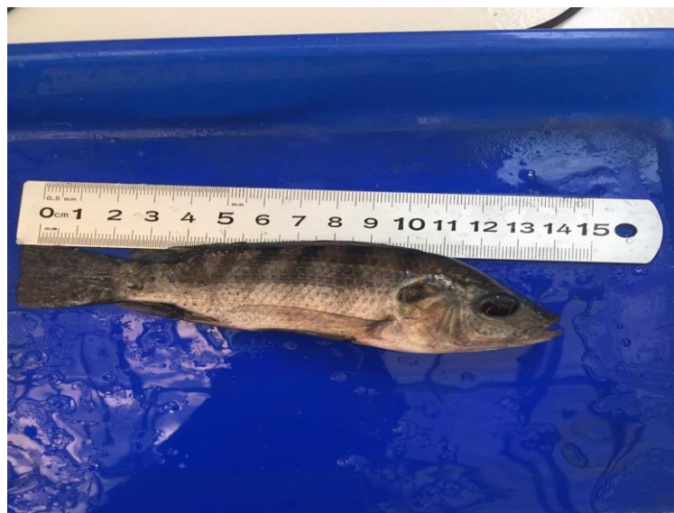
Fig 8:- Measurement of final Tilapia ( Oreochromis niloticus ) rearing

While Rakocy, (2006); Sastro, Y (2015) states that aquaponics can be described as an amalgamation of aquaculture (fish culture) systems and hydroponics (plant or vegetable cultivation without soil media). This system adopts an ecological system in the natural environment, where there is a symbiotic relationship between mutualism of fish and plants. Environmentally friendly biofloc and aquaponic development systems can reduce water replacement because there is a water purification cycle process that will turn food waste and toxic gases such as ammonia and nitrite into harmless compounds. By minimizing the replacement of water, the opportunity for entry of germs from outside can be reduced. Water replacement is usually only done to replace water that is evaporating or seeping. The system is more stable than the usual probiotic system because biofloc is a bacterium that does not stand alone, but in the form of floc or a group of several floc-forming bacteria that synergize with each other (Avnimelech Y. 2012). The development of a combination of biofloc and aquaponic systems in the maintenance of