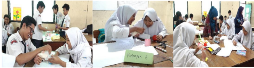
Figure 3. Students activity in finding the volume of a sphere

by students. This stage's activity is necessary to encourage the idea of the sphere's volume from formal to informal steps to be grasped.