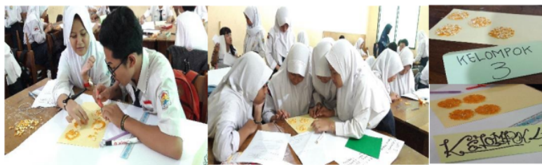
Figure 2. Students activity in discovering the surface area of the sphere

Students need precision, ingenuity, and critical thinking in this stage because they have to evaluate and determine the sphere's surface area by utilizing orange fruit. The outcome is students can make precisely if one peel of an orange fruit (as a sphere) is equal to four times the area of circles. Besides, students could accurately calculate and infer if the sphere surface area is four times the circle area. Figure 2 depicts the students' activities during this phase.