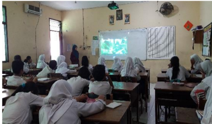
Figure 1. Students observing interactive video of Megono Gunungan tradition

The teacher gives the material that students have learned before beginning Activity 1. The teacher reviews material utilizing the query and response method, and the students were actively engaged in the discussion of previous material. The students also observed the video using the Megono Gunungan context with real enthusiasm, as the video was shown in interactive media. Figure 1 is an illustration of the students watching the Megono Gunungan video.