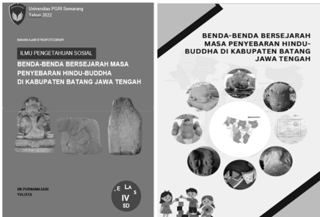
Figure 1. Ethnophotography-Based Teaching Material Design

teaching materials used during the process of learning activities at school, student characteristics as well as learning resources that are often used in learning, as shown in Table 1.