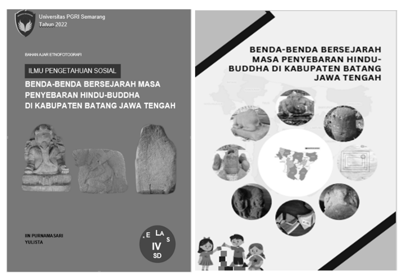
Figure 1. Ethnophotography-Based Teaching Material Design

teaching materials used during the process of learning activities at school, student characteristics as well as learning resources that are often used in learning, as shown in Table 1.