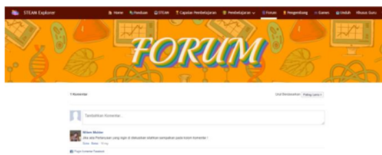
Figure 6. Discussion forum view

Besides that, in the web-based science learning media with the STEAM approach that we have developed, a discussion forum is provided that serves as a place to provide feedback and ask questions if students are still experiencing difficulties in learning wherever and whenever it can be accessed. According to Fatmawati (2019) discussion is a form of scientific dialogue carried out by several people in one group with the aim of exchanging opinions about problems to find solutions together so as to get answers and the truth of the problem. The main function of the forum is as a place for students, teachers, or other participants to discuss, share ideas, and exchange views. Forums allow users to initiate discussion topics, provide feedback, and ask questions, which supports discussion and reflection-based learning (Effendy et al., 2016). Learning time at school can be used effectively and efficiently.