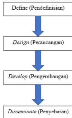
Figure 1. R&D research flow

The type of research used in this research is development research using the Research and Development (R&D) method. The model used in this development research is R&D developed by Thiagarajan which consists of four stages of development, namely define, design, develop, and disseminate.