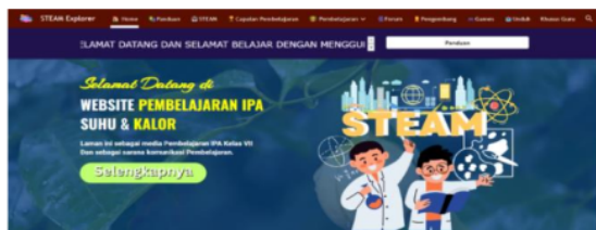
Figure 2. Front View of the Website

Web-based science learning media with the STEAM approach that has been carried out has characteristics that distinguish it from previous studies. The developed website has a design that is easy to use and eye-catching. Web-based learning becomes a tool for continuing knowledge by providing opportunities for instructor-student interaction which impacts student commitment and improves the teaching and learning environment (Togas et al. 2021; Jaaman et al., 2013). In developing the web design, the color selection method is used based on color psychology. The selection of basic colors in the developed media includes red (giving energy and calling for the implementation of an action), yellow (stimulating mind and mental activity that helps logical and analytical reasoning), blue (dark blue can stimulate clear thinking and blue) youthful helps calm the mind and improves concentration) and orange (gives a warm and vibrant impression and is a symbol of adventure, optimism, confidence, and social skills). In developing web-based science learning media, features are made that have characteristics to provide comfort to users.