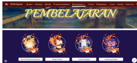
Figure 4. STEAM Learning Flow

Apart from that, the STEAM learning flow is also supported by a scaffolding system which helps students with various learning style backgrounds to understand the flow and knowledge built on the website. By using scaffolding techniques, a teacher or instructor can identify learning difficulties at various stages of the learning process and take corrective action to achieve optimal results (Krishnan, 2019).