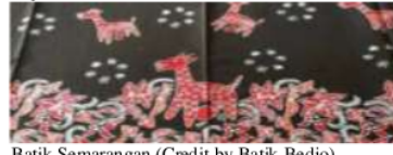
Batik Semarang