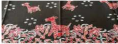
Batik Semarang