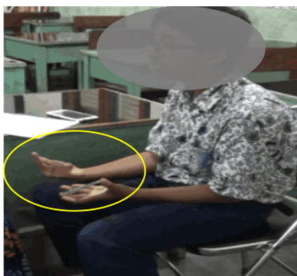
Figure 6. Representational gestures of constants