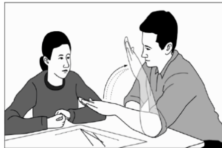
Figure 9. Representational gestures of a slope of the line (Alibali & Nathan, 2011, p.15)

The prior study on gestures (Alibali et al., 2011) explained that gestures could be utilized during the learning process in the form of representational, writing, and pointing gestures. More specifically, it described gestures created by the students in understanding the slope of line equations by doing movements, as shown in Figure 9. Besides, the students also employed writing and pointing gestures to affirm the explanations given, as shown in Figure 10. If we compare it with the current study, there is evidence of gesture consistency created by the students in understanding mathematical concepts.