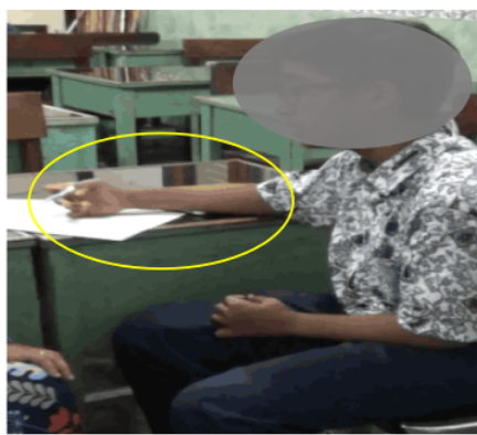
Figure 7. The student used pointing gestures

In Figure 7, the student used gestures as an attempt to reinforce explanations about variables, coefficients, and constants by pointing to 5a + x^2 + xy + 4x + 5y - 5 on the paper as a symbol of the variables, coefficients, and constants.