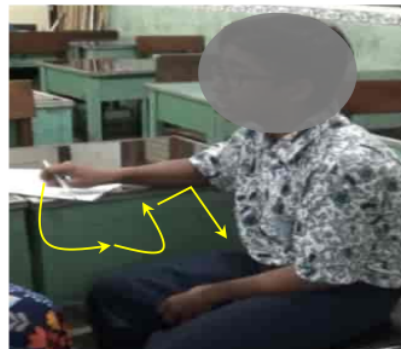
Figure 2. Indirect representational gestures of variable and coefficient

Figure 1 shows that the student performed indirect representations of variables: In this case, the books, whose number was unknown, placed in a large box, through the position of the fingers stretched as if representing a large box and an indirect representation of the coefficients through progressive hand movements in two different directions. On the other hand, Figure 2 shows that the student performed indirect representations of variables, in this case, the books, whose number was unknown placed in a small box, through the position of the fingers gathered together as if representing a small box and an indirect representation of the coefficients through continuous hand movements in three different directions.