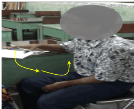
Figure 1. Indirect representational gestures of variable and coefficient