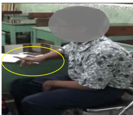
Figure 4. Representational gestures of the coefficient