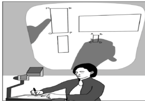
Figure 10. Writing and pointing gestures (Alibali & Nathan., 2011, p.12)

The contribution of this present study is the description of the students' gestures about the algebraic concept, whereas prior studies (e.g., Alibali et al., 2013) focused on geometry topics such as graphs. Moreover, we found two types of representational gestures: direct and indirect. The direct representational gesture was used by the students when describing 2x - 9 (Figure 4, Figure 6, Figure 7). The indirect representational gesture was utilized by the student when explaining 2x + 3y . The students performed indirect representations of variables (Figure