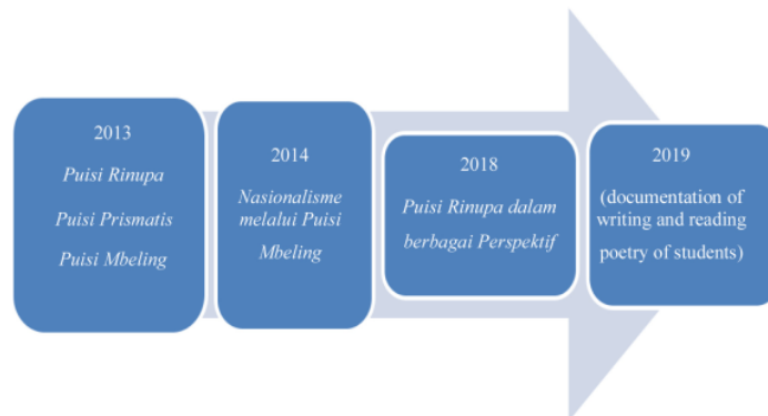
Figure 2. The Research Roadmap of The Authors

In addition, the use of poetry as a medium of emotional therapy in Society 5.0 stimulates the emergence of collaborative studies. Borrowing the terms of the field of linguistics, namely the existence of macro-linguistics (the study of language is related to things outside of language) and micro-linguistics (the study of language is only about the structure without involving other fields), so