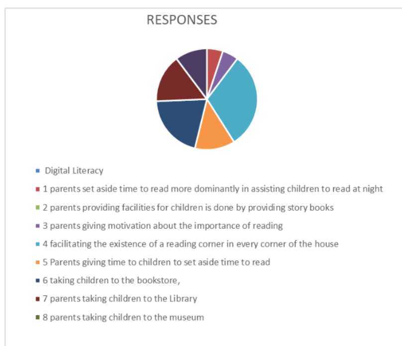
Figure 1. Diagram of Strengthening Digital Literacy in Family Education